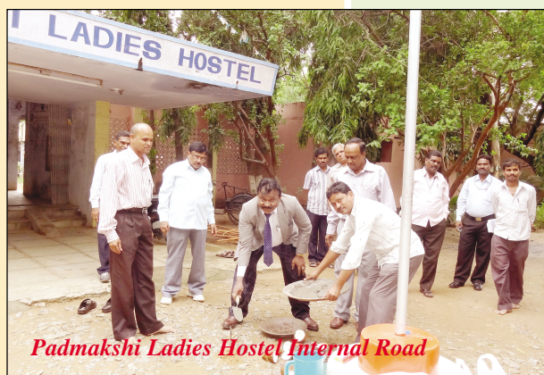
Padmakshi Ladies Hostel Internal Road