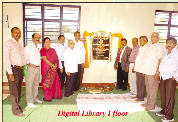
Digital Library 1 floor