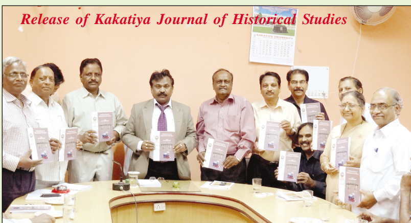
Release of Kakatiya Journal of Historical Studies