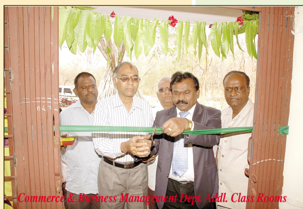
Commerce & Business Management Dept. Addl. Class Rooms