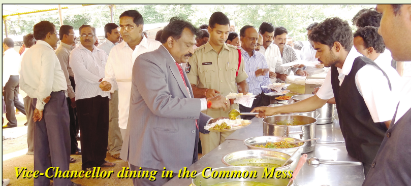
Vice-Chancellor dining in the Common Mess