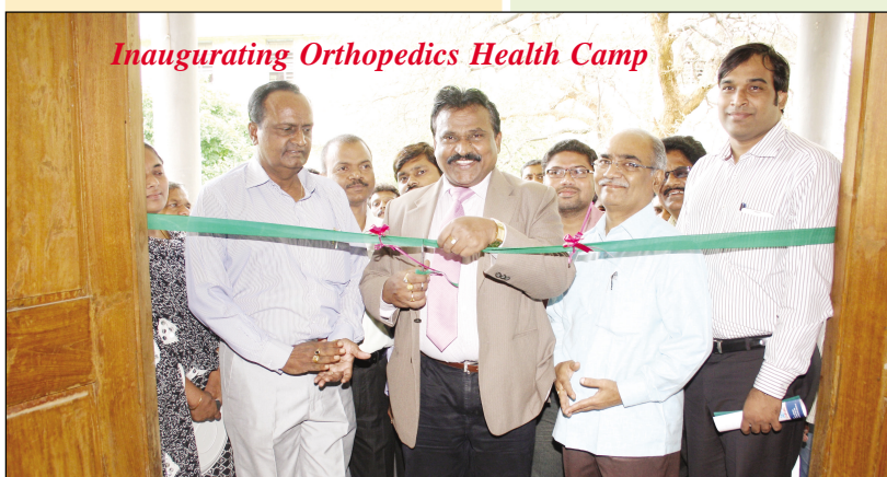
Inaugurating Orthopedics Health Camp