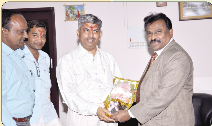
VC felicitating Sri Rapolu Ananda Bhaskar, Rajya Sabha Member