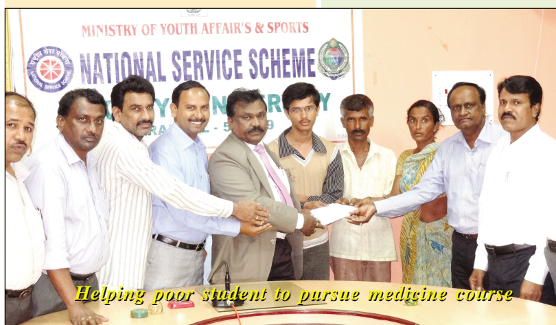
Helping poor student to pursue medicine course