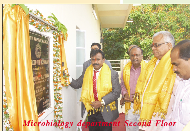
Microbiology department Second Floor