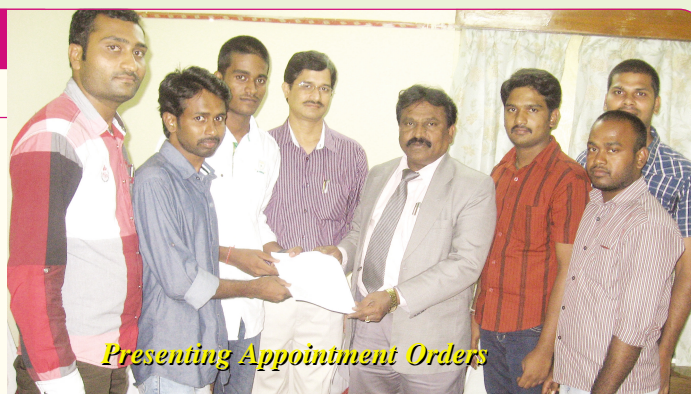
Presenting Appointment Orders