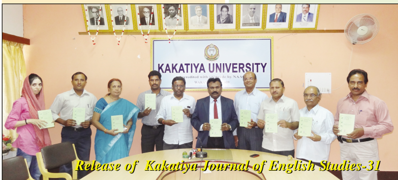
Release of Kakatiya Journal of English Studies-31