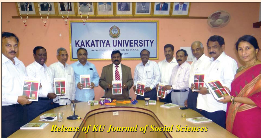
Release of KU Journal of Social Sciences