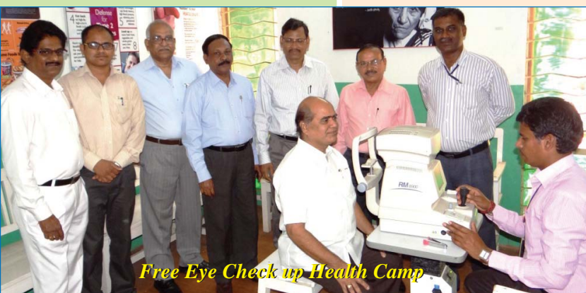
Free Eye Check up Health Camp