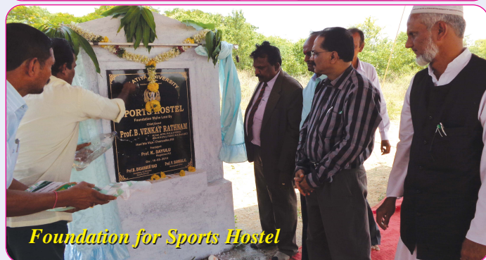
Foundation for Sports Hostel