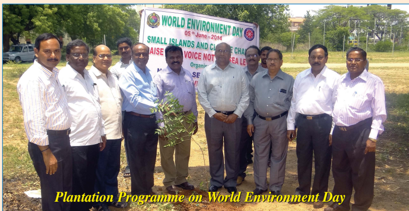
Plantation Programme on World Environment Day