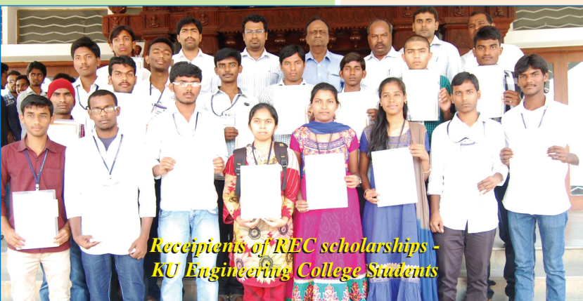
Recipients of REC scholarships - KU Engineering College Students

University Arts & Science College, Subedari which is a constituent college of Kakatiya University has been re-accredited with 'A' grade by National Assessment and Accreditation Council (NAAC), Bangalore on February 21, 2014. It is one of the oldest premier intuitions of higher education in Telangana State. Having 87 years of glorious history of academic excellence, the college is recognised as College with Potential for Excellence by UGC and also STAR College by DOBT, Govt. of India. The College offers 32 under graduate and 10 post graduate programmes in difference disciplines.