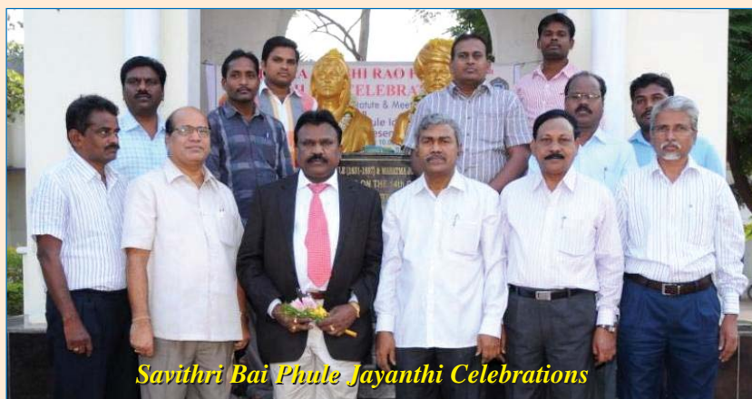
Savitri Bai Phule Jayanthi Celebrations