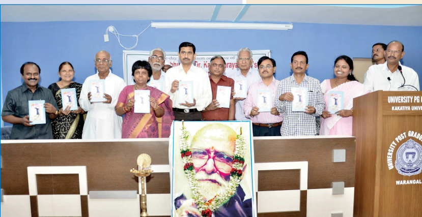
Release of Book on Kaloji Vardhanthi