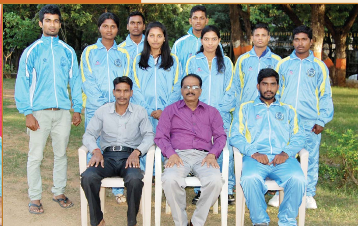
All India Inter University Tournament Archery (Men & Women) 2014 - Bronze Medal