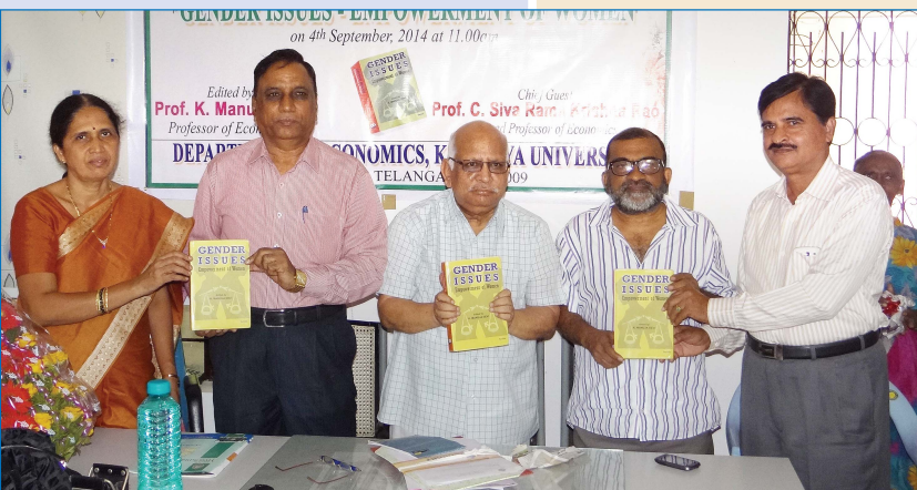
Release of book "Gender Issues-Empowerment of Women"