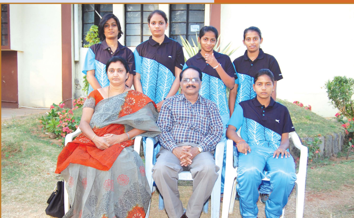
All India Inter University Badminton (Women) 2014 - Silver Medal