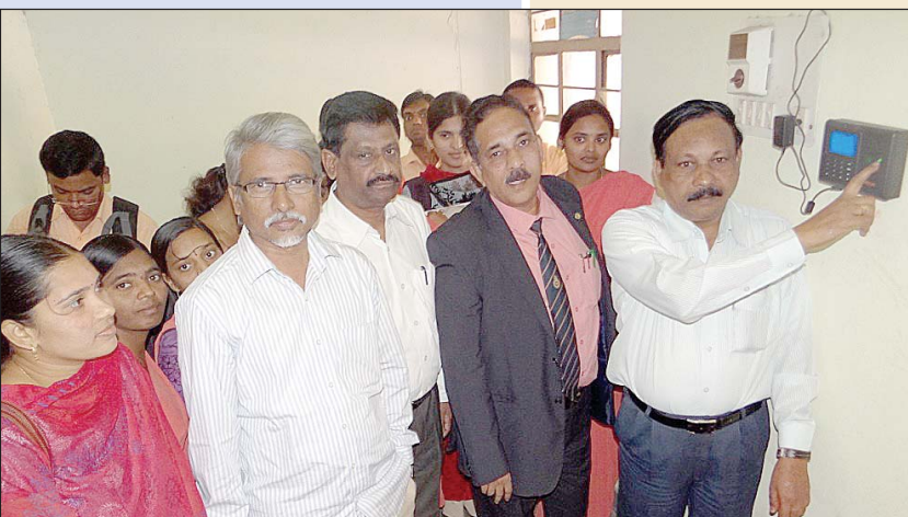
Inauguration of Biometric system at University College of Education