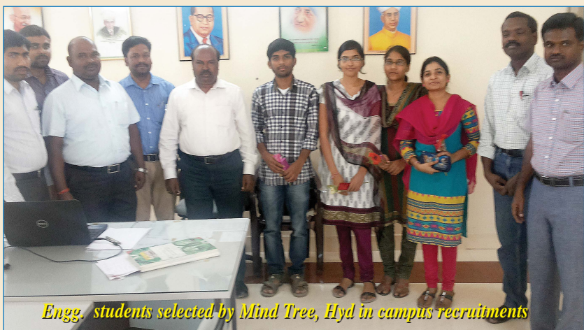
Engg. students selected by Mind Tree, Hyd in campus recruitments