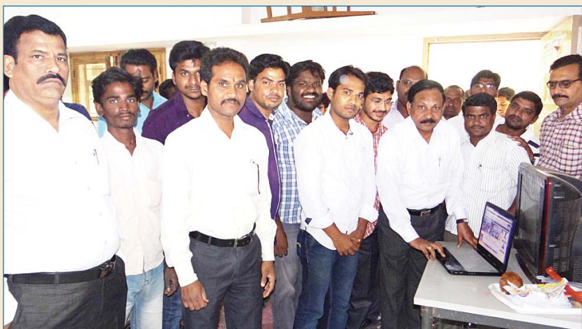
Inauguration of Wi-Fi facility in the Hostel