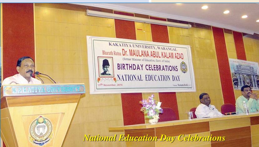
National Education Day Celebrations