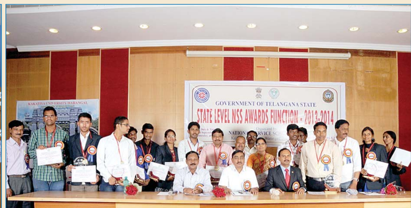
Telangana State Level NSS award winners