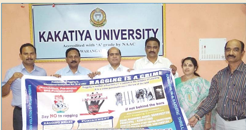
Release of Anti-Ragging Banner