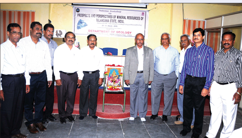
Inauguration of One Day Workshop in Geology