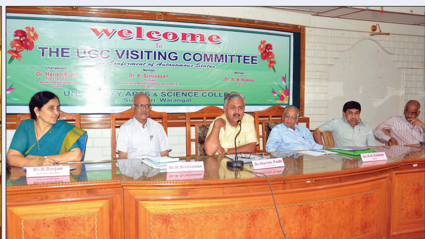
UGC Visiting Committee for autonomous stature to Univ. Arts & Science, College, Subedari