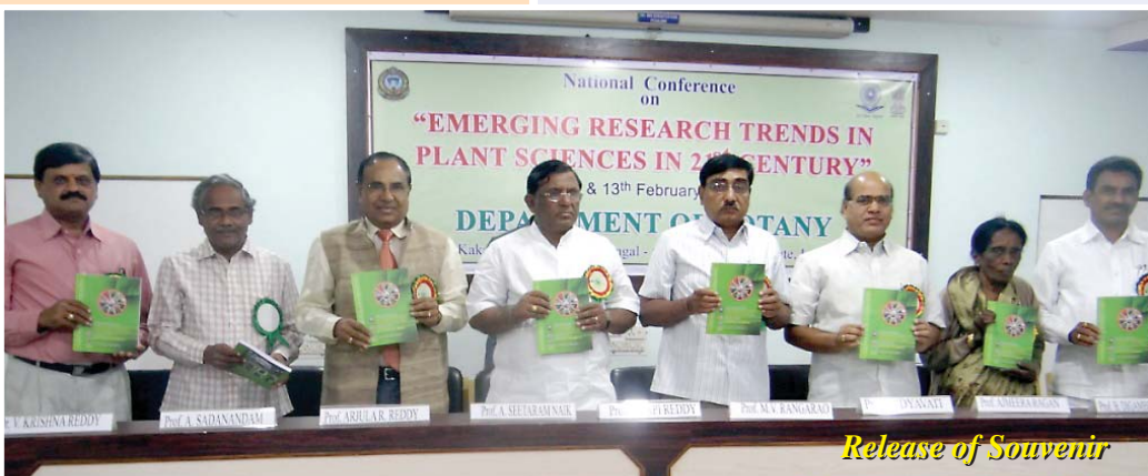
Release of Souvenir