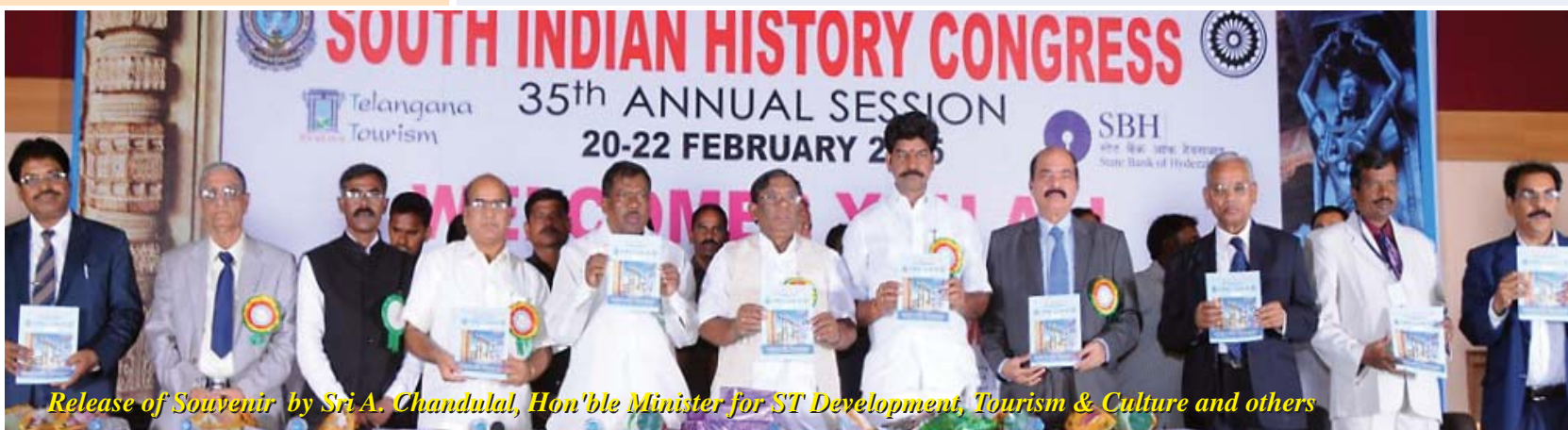
Release of Souvenir by Sri A. Chandulal, Hon'ble Minister for ST Development, Tourism & Culture and others