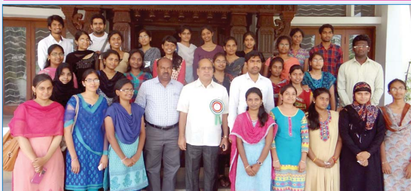
KU College of Engg. & Technology Students who got placements with I/c Registrar & Principal