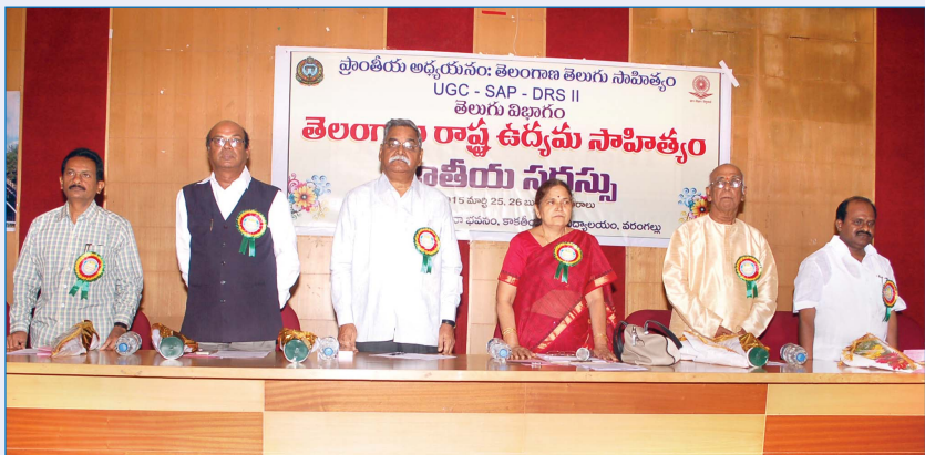
Seminar on "Telangana Rashtra Udyama Sahithyam"