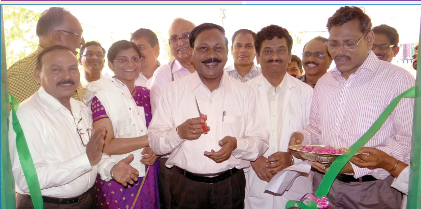
Inauguration of Health Camp