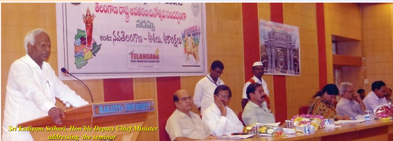
Sri Kadiyam Srihari, Hon'ble Deputy Chief Minister addressing the seminar