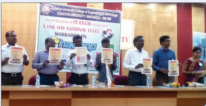
Release of IT Club Brochure of KU College of Engg. & Tech. and workshop on "Big Data Hadoop"