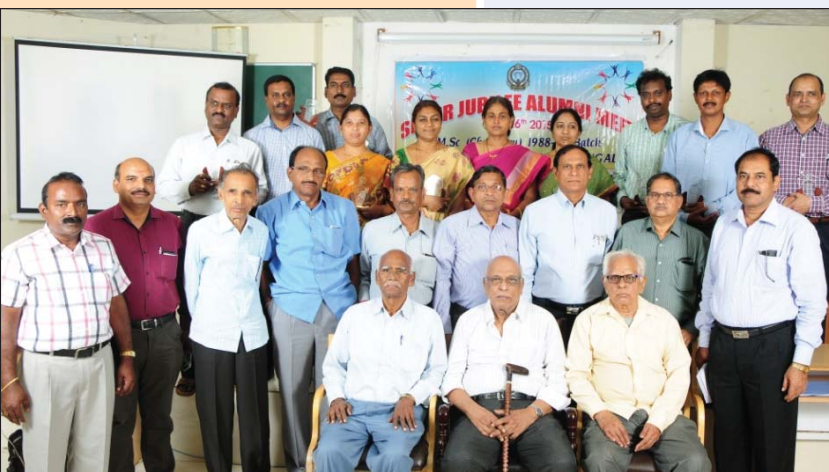
M.Sc. Chemistry, University College, Alumni Meet (1988-90 batch)