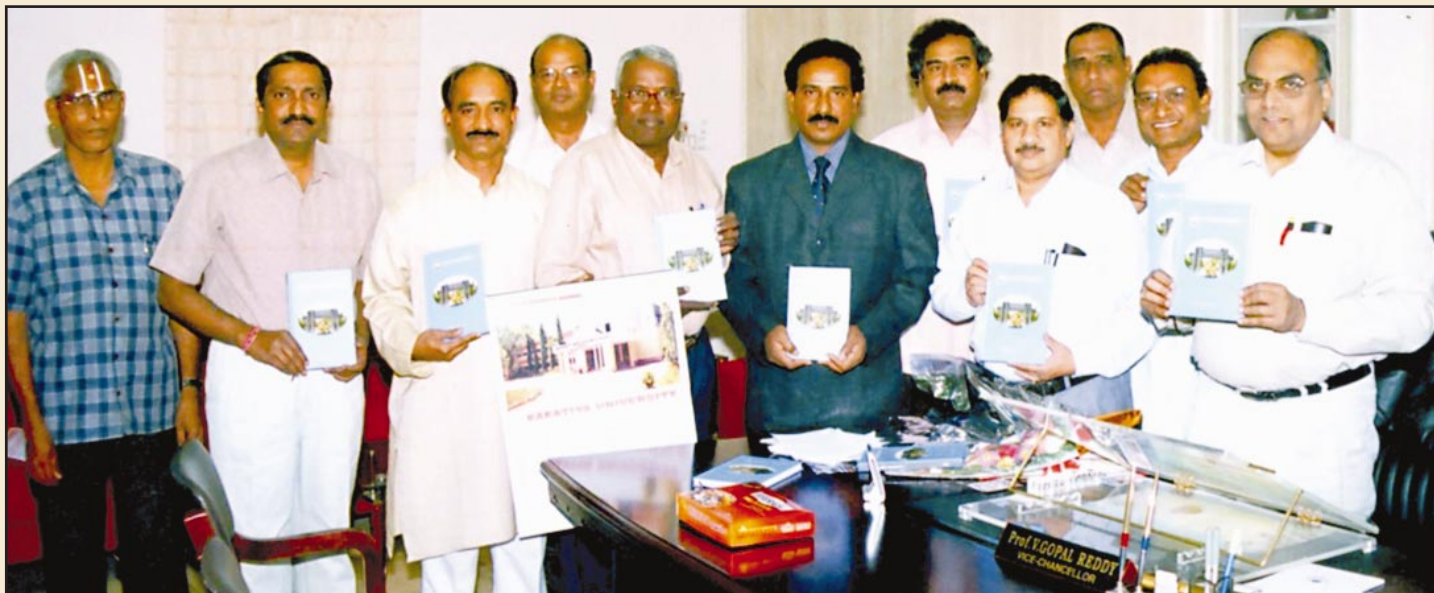
Release of University Diary & Calendar 2006 by the Vice-Chancellor