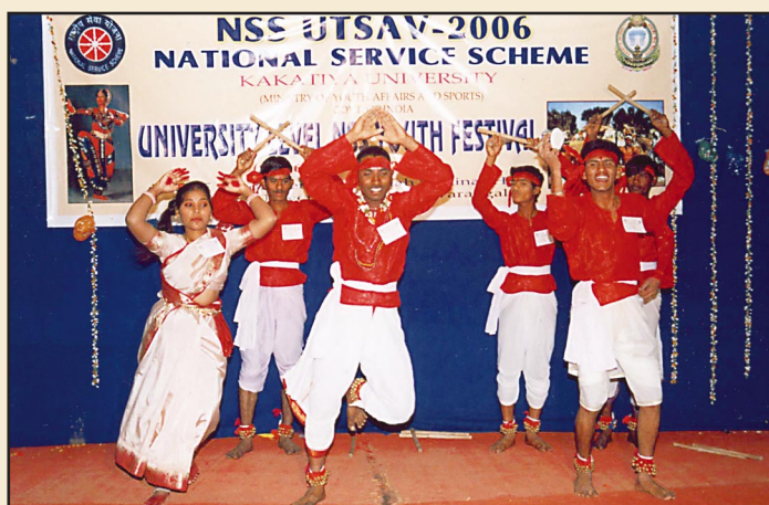
Students performing at the NSS UTSAV-2006 University Level Youth Festival