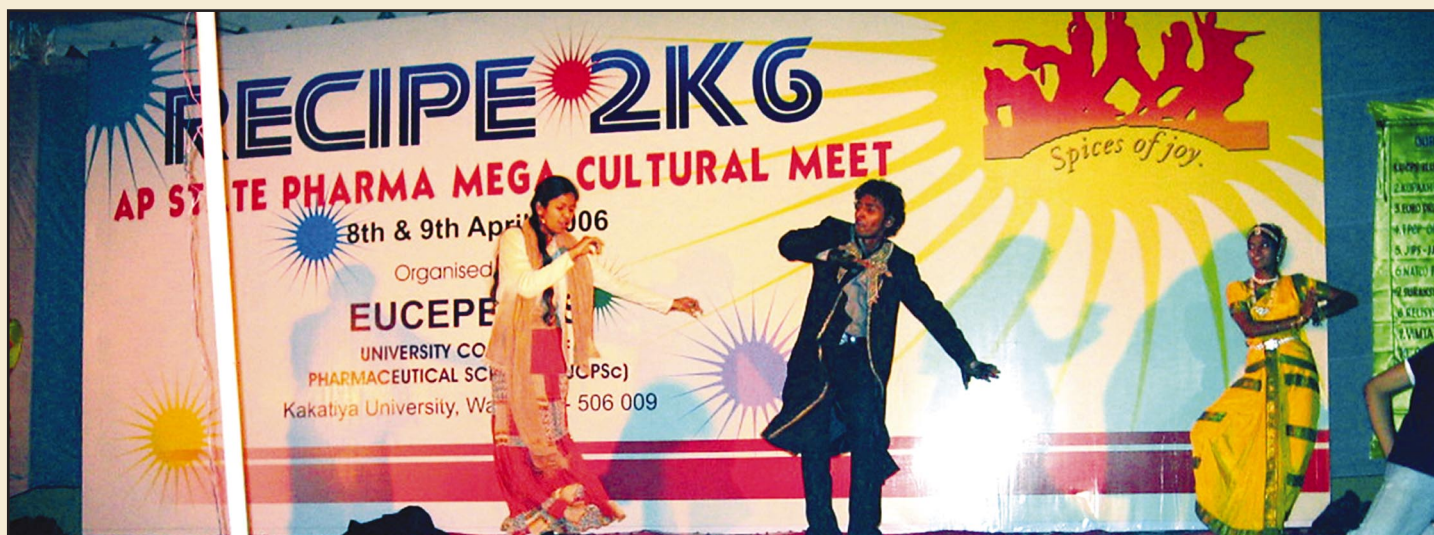
Students performing at RECIPE 2K6