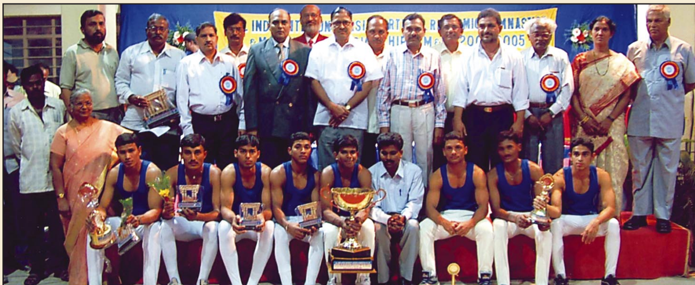
Kakatiya University Gymnastics Team that won the All India Championship consecutively for the third time