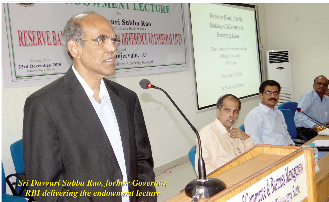
Sri Duvvuri Subba Rao, former Governor, RBI delivering the endowment lecture