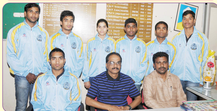
Gymnastics Gold Medal - All India Inter University 2016