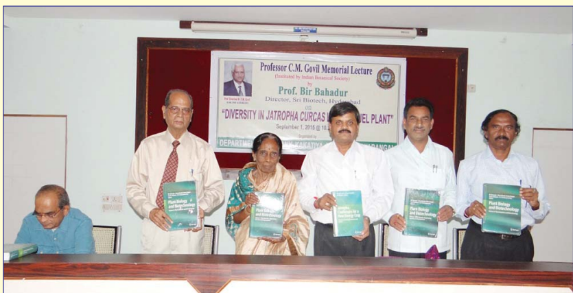
Release of book