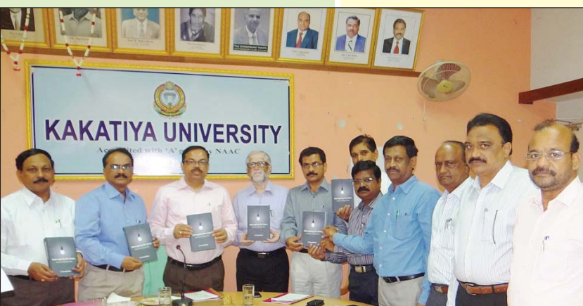
Release of Book "Interrogating the cannons: Literture and Pedagogy"