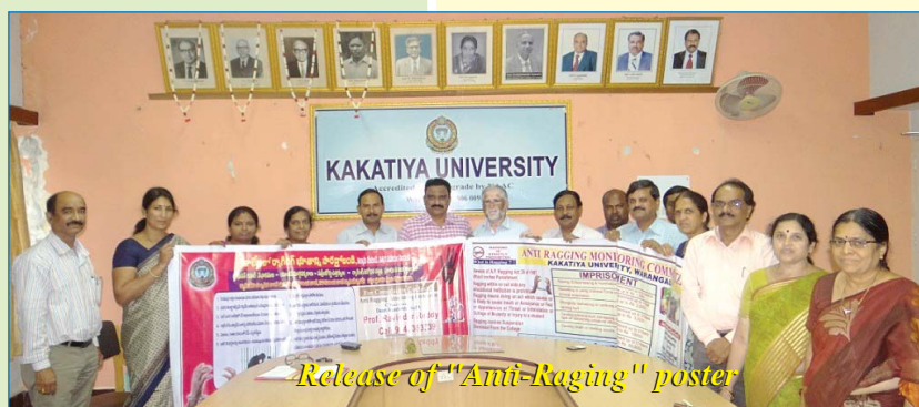
Release of "Anti-Ragging" poster