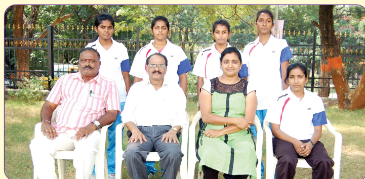
Badminton 4th Place - South Zone Inter University 2015