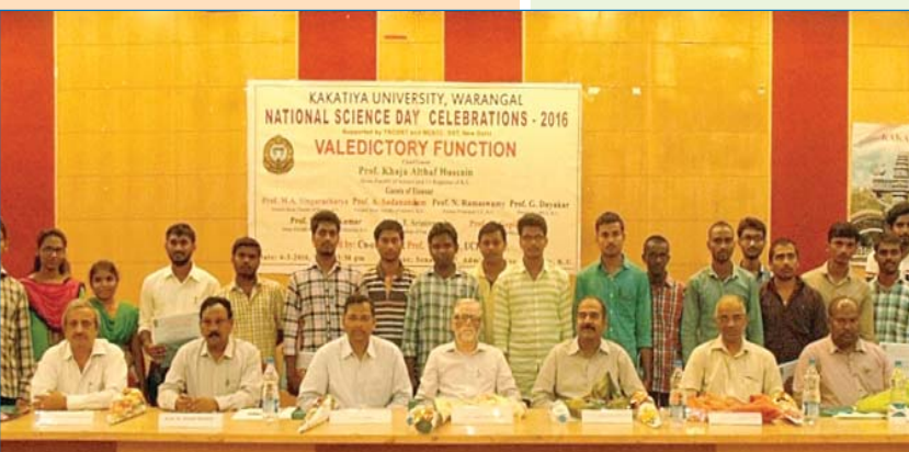
National Science Day Celebrations 2016