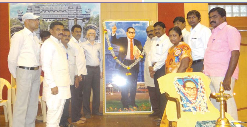
Dr. B.R. Ambedkar Birthday celebrations