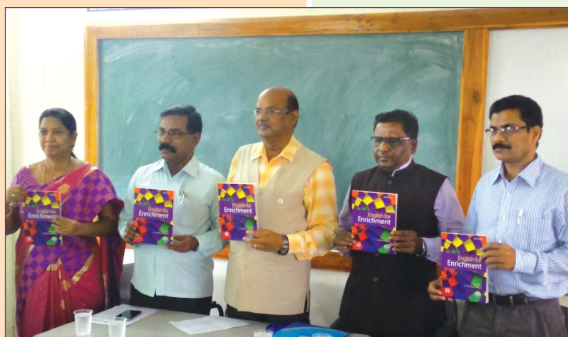
Release of Degree (CBCS) I year text book "Enriching English"