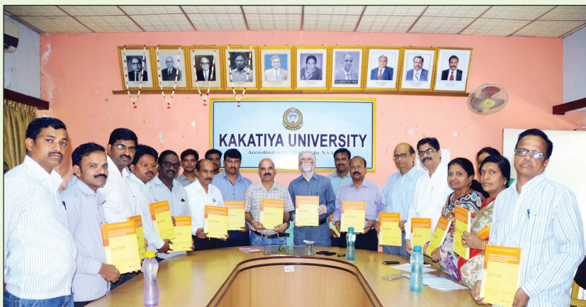
Release of "Journal of Physics"