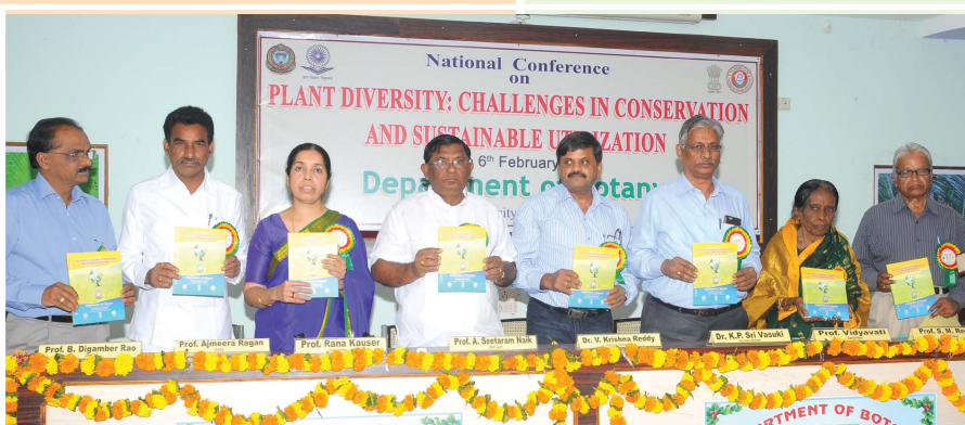
Release of Souvenir