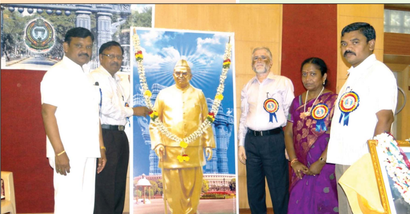
Dr. Babu Jagjivan Ram Birthday celebrations