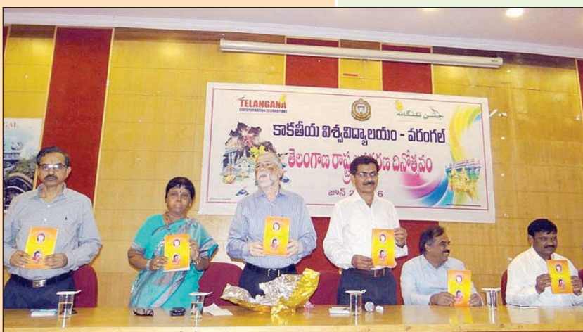
Release of book "Telangana Telugu Katha Sahithyam" on T.S. Formation Day