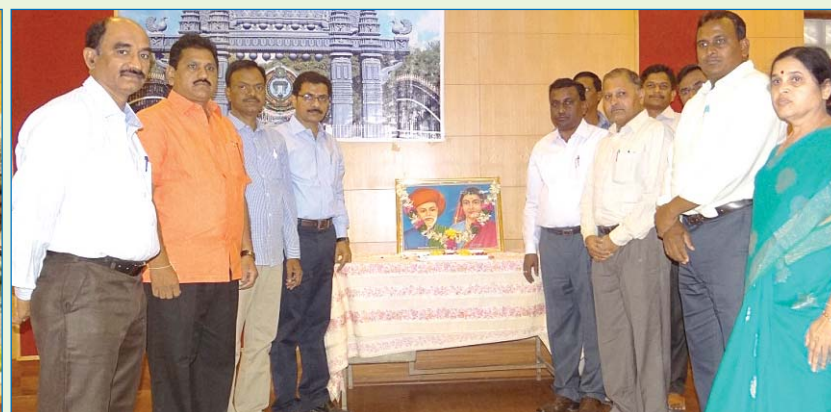
Mahatma Jyotirao Phule birthday celebrations