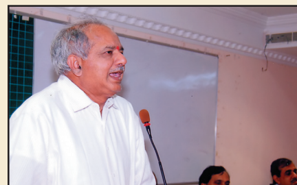
Prof.K.Raj Reddy of Carnegie Mellon University,USA addressing the students of 21st Century Gurukulam