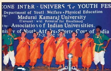
Folk Dance by KU students