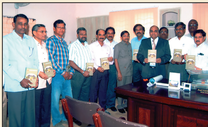
Release of Diary & Calendar of 2007