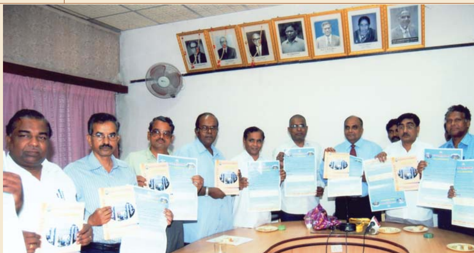
Release of Prospectus & Brochure of Executive MBA course of SDLCE