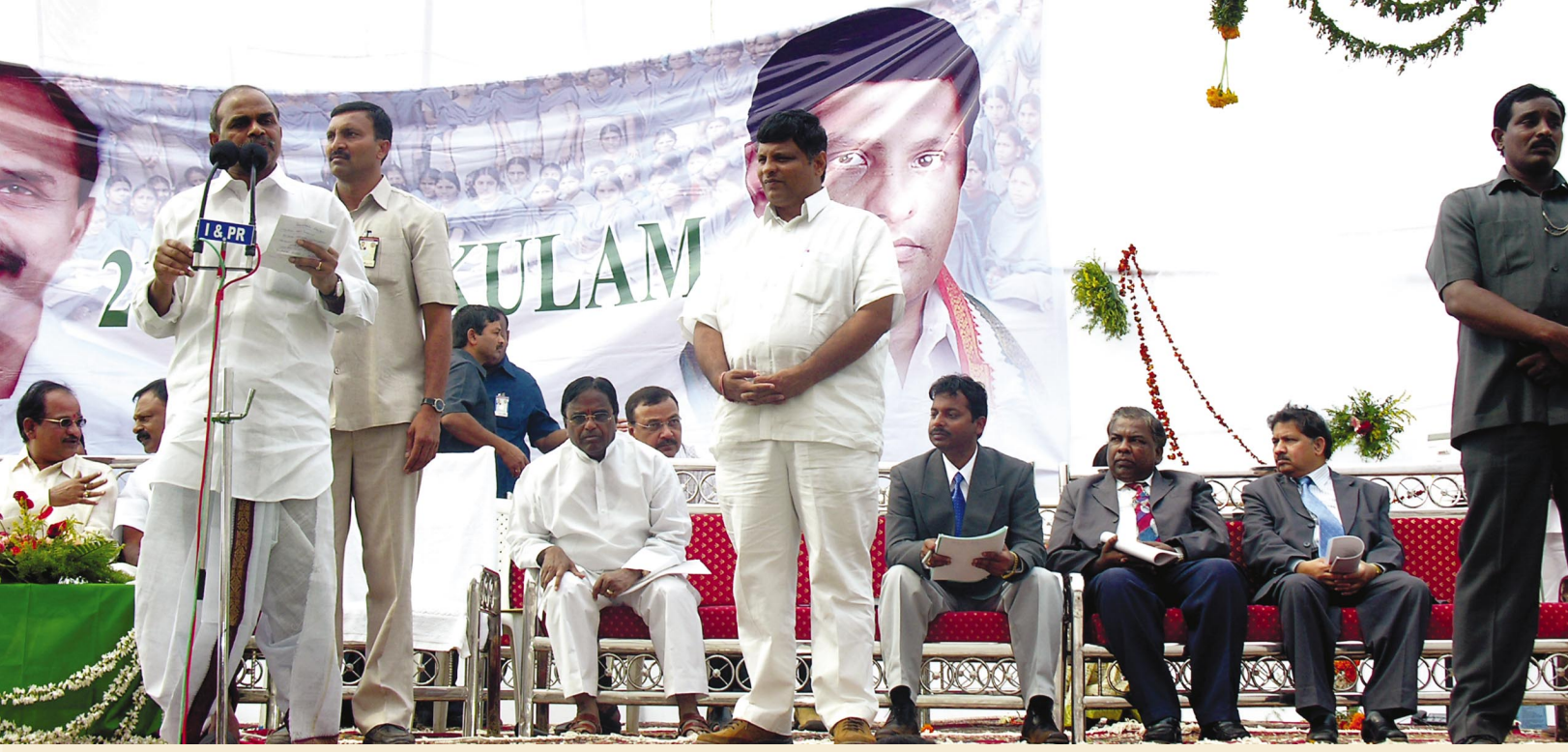
Hon'ble Chief Minister Dr.Y.S. Rajasekhara Reddy at the foundation stone laying ceremoiny of 21st Century Gurukulum at Ashwraopet in Khammam on January 27, 2008.