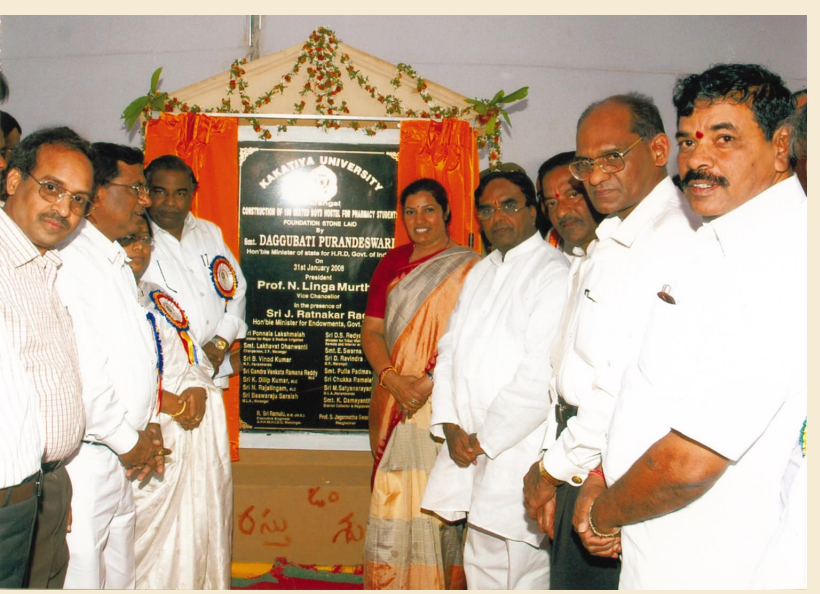
Minister of State of HRD, Mrs. Daggubati Purandeswari at the foundation stone laying ceremony