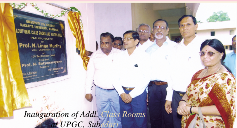
Inauguration of Addl. Class Rooms at UPGC, Subedari