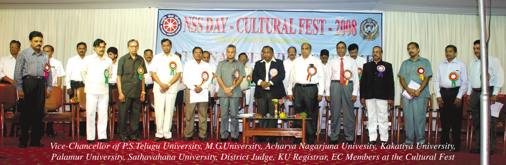
Vice-Chancellor of P.S.Telugu University, M.G.University, Acharya Nagarjuna Univesity, Kakatiya University, Palamur University, Sathavahana University, District Judge, KU-Registrar, EC Members at the Cultural Fest