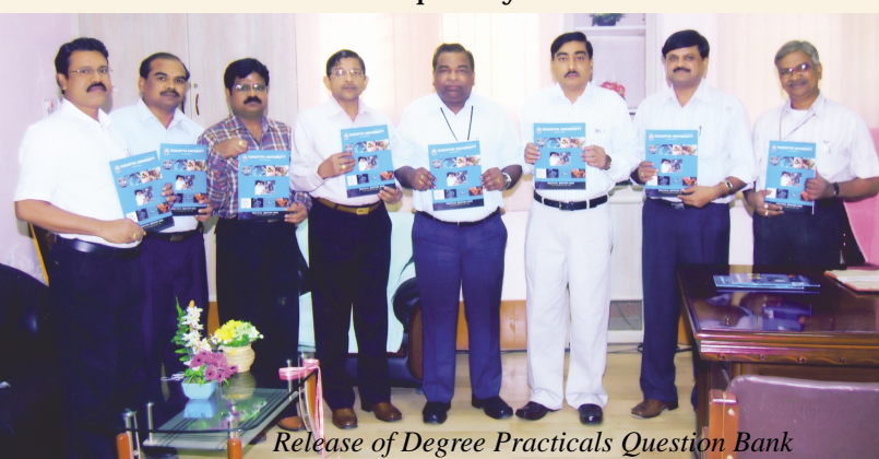
Release of Degree Practicals Question Bank