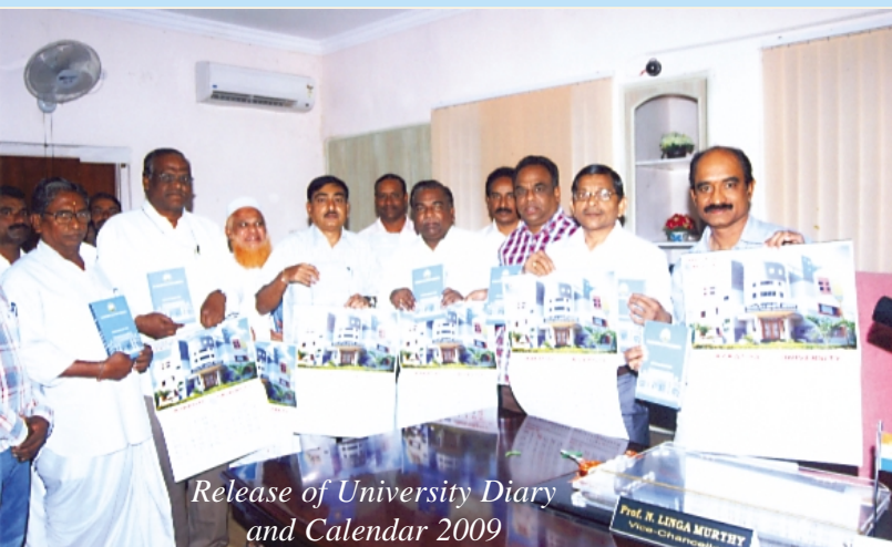
Release of University Diary and Calendar 2009