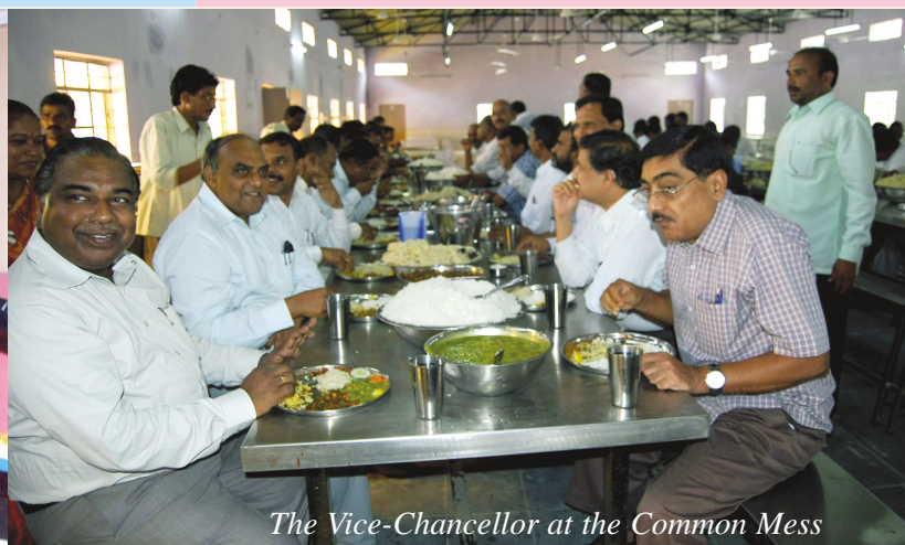
The Vice-Chancellor at the Common Mess