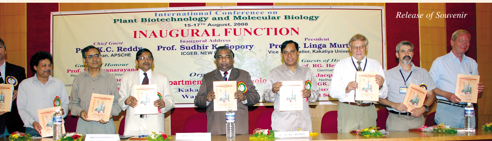
Release of Souvenir