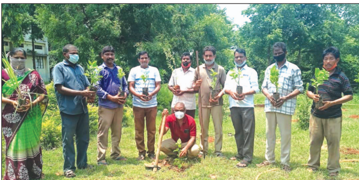
Plantation at University College of Engineering, Kothagudem