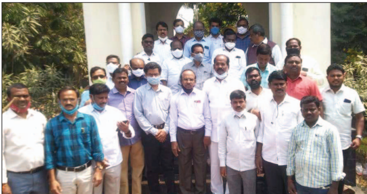
130th Dr. Baba Saheb Ambedkar Jayanthi Celebrations

Mahatma Jyotirao Phule Jayanthi day was celebrated on 11 April, 2021 by paying floral tributes by teaching and Non-Teaching staff. Also known as Jyotiba Phule, was an Indian social activist, thinker, anti-caste social reformer. He and his wife, Savitribai Phule, were pioneers of women education in India.