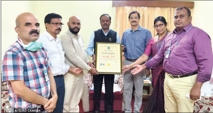
ISO 9001-2015 Certificate Presentation