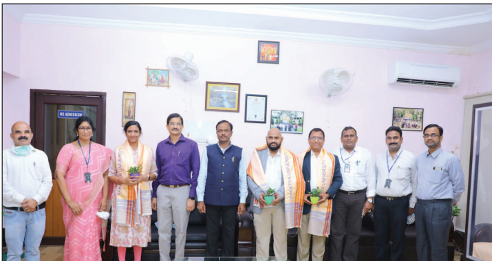
Felicitations to ISO Team