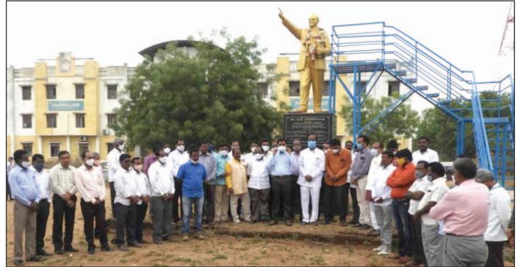
130th Dr. Baba Saheb Ambedkar Jayanthi Celebrations

Ambedkar Jayanti Day was celebrated on 14 April, 2021 to mark the birthday of Dr Bhimrao Ramji Ambedkar, Father of the Constitution of India and civil rights activist. Dr. Ambedkar strongly believed that inequalities like the caste system are detrimental to the democracy. He incorporated his vision of equal rights for all into several laws laid down in the Constitution. On this occasion, floral tributes were paid by teaching and Non-Teaching staff.