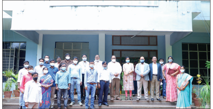
ISO Team Visits to Bio-technology Department