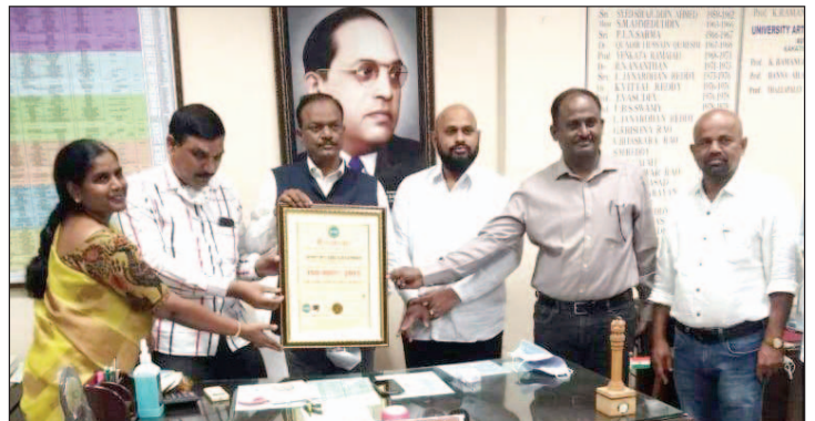
University Arts and Science College ISO Certification