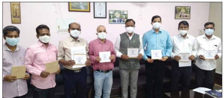
Releasing of Degree Examination Results