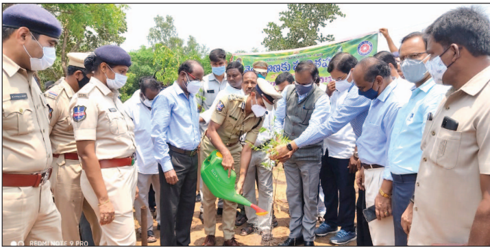
Dr. Tarun Joshi, IPS, Commissioner of Police, Warangal at Harithaharam Programme

The 10-day programme from July 2nd to 11th, 2021 was formally launched in the University campus by Prof. T.Ramesh, Vice-Chancellor. The University assigned responsibilities to different departments and Constituent Colleges and ensured the implementation of the programme in a well designed way. The University planted 1200 saplings in 2 acres covering all the departments. Haritha Haram drive is expected to result in lowering of climatic temperatures, reduction in pollution levels, increase in general public health, increase in wild resources, and enhancement of wildlife and biodiversity.