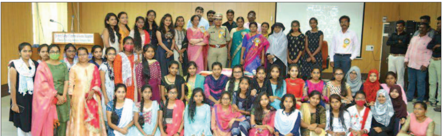
International Womens Day Celebrations at Univ. Commerce College