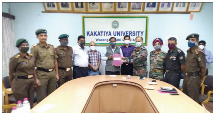
NCC Officers Meeting