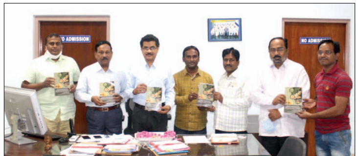
Book Releasing - Bio-technology