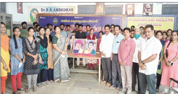
124th Vardhanthi of Savitri Bai Phule at Dr. B.R. Ambedkar Study Centre