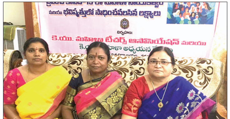
Zoom meeting on the eve of International Womens Day at KU campus