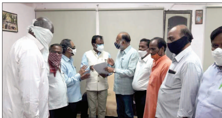
NGO's Association (Retd.) with the Vice-Chancellor