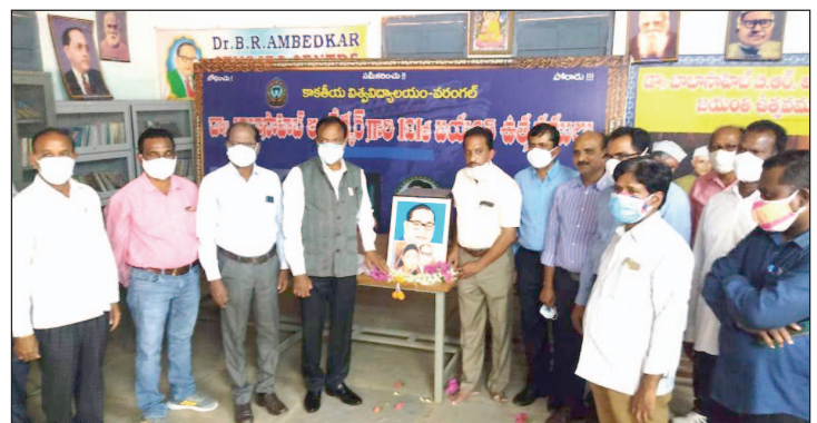
Ramabai Ambedkar 86th Vardhanthi