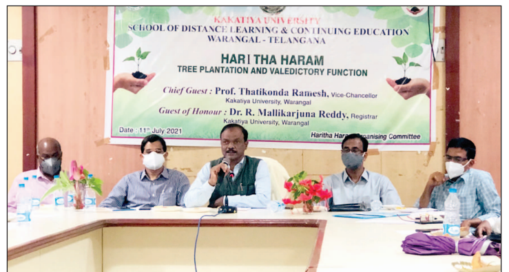
Valedictor Programme of Haritha Haram at SDLCE