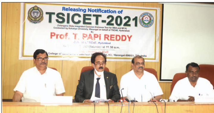
TS ICET - 2021 press meet