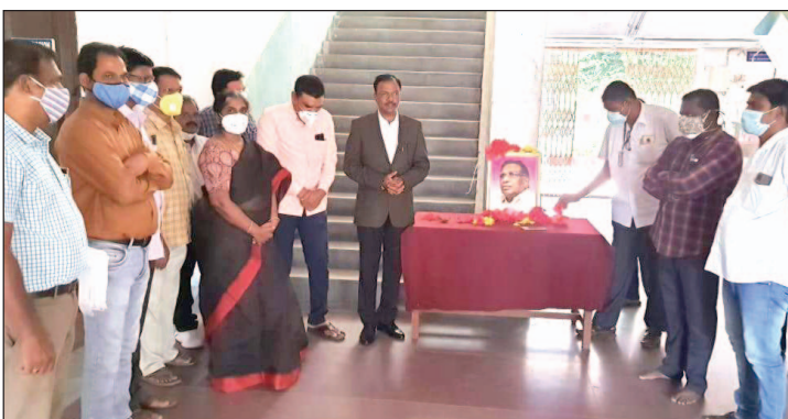
124th Vardhanthi of Savithri Bai Phule at Dr. BR Amedkar Study Centre