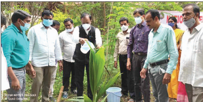
Plantation at University P.G. College, Subedari, Hanamkonda