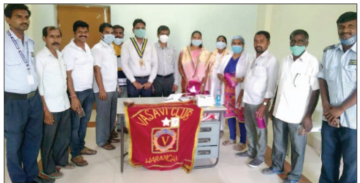
Felicitations to Staff involved in Vaccination drive at KU