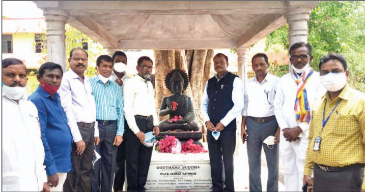
130th Dr. Baba Saheb Ambedkar Jayanthi Celebrations

Buddha Jayanti on 26th May 2021, marks Lord Buddha's 2583rd birth anniversary. It was celebrated at the Central Library in the University campus. The day is also celebrated to remember the time Buddha achieved nirvana (salvation) under the Mahabodhi tree at Bodh Gaya. He was remembered as - a philosopher, spiritual guide, religious leader, meditator who attained enlightenment after continuous meditation for 49 days under the banyan tree.