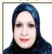
Twaij Ph. D (English) Iraq