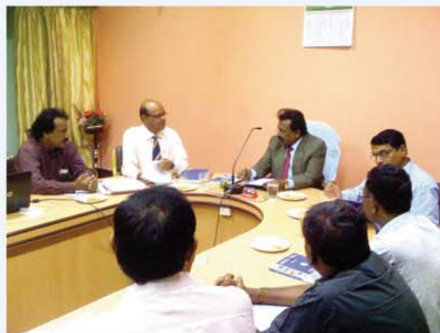
Advisory Board Meeting in progress in August 2012