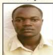
Reagan B. Pharmacy Uganda