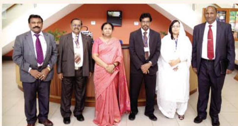
Vice-Chancellor's Foreign Visits to Jamaica and Australia in November 2012