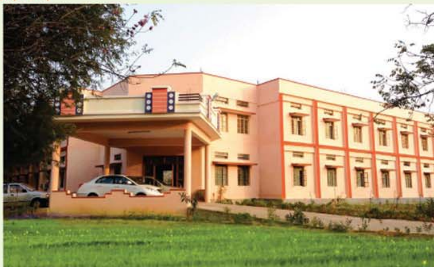
Department of English (DE) / Centre for English Language Training (CELT)/ Centre for Foreign Relations, Research and Consultancy (CFRAC)

Keeping in view of the need for better communication skills, the Centre for English Language Training (CELT) has been established with an objective to impart training in Spoken English and communication skills to the students of the University as well as the general public with a state-of-the-art Digital Language Laboratory. The CELT offers programmes like "Spoken English" for beginners, "Corporate Communication and Soft Skills" for professionals, "Orientation Course in Teaching Communication Skills" for teachers, "Grammar and Pronunciation" for the school students, and need based courses for the research scholars.