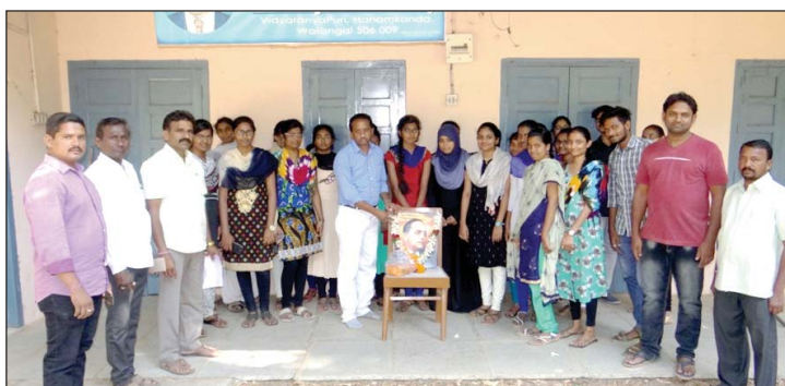
Indian Constitution Day