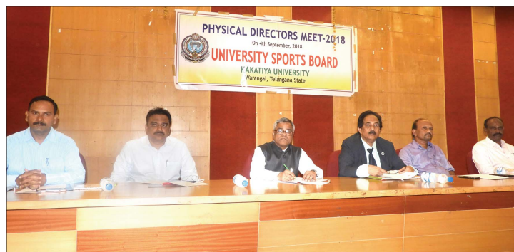
Physical Director's Meet