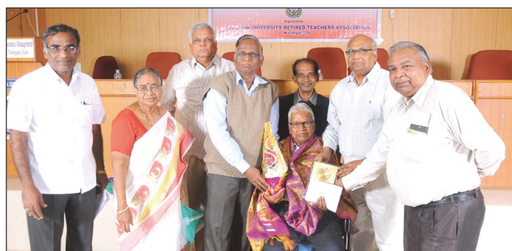
Felicitations on Pensioners Day