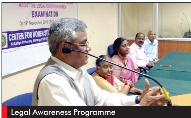
Legal Awareness Programme