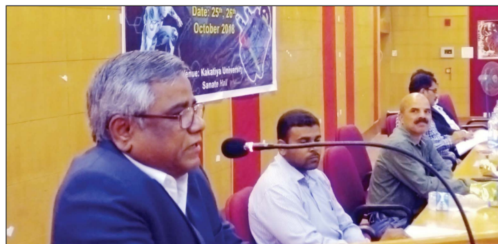
Seminar on Robotics