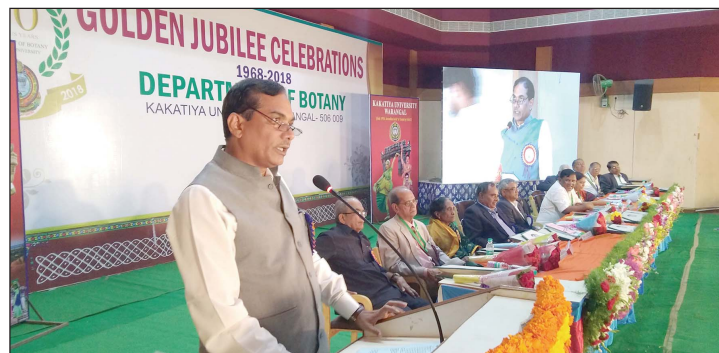
Golden Jubilee Celebrations - Botany Dept.