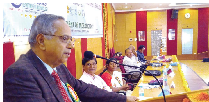
Silver Jubilee Celebrations - Microbiology Dept.