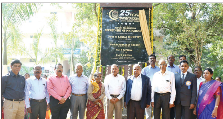
Dignitaries at the Silver Jubilee Celebrations Pylon of Microbiology Department