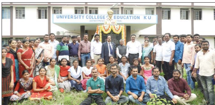
Teachers Day Celebrations