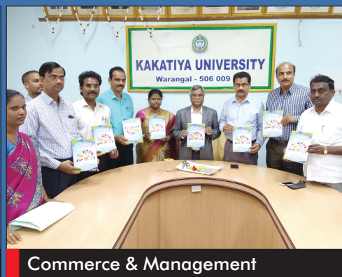
Commerce & Management