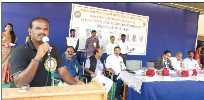
Inter Collegiate Tournaments