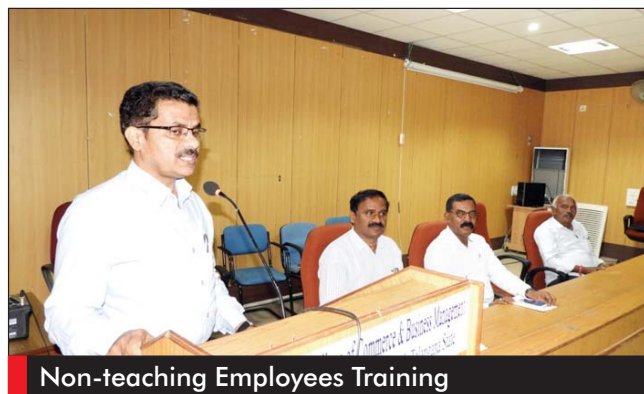
Non-teaching Employees Training