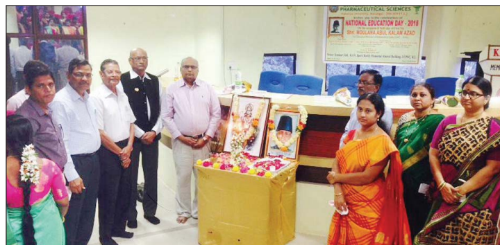
National Education Day