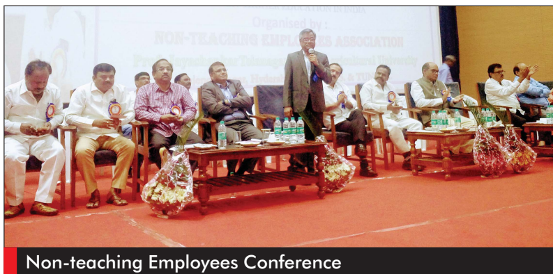
Non-teaching Employees Conference