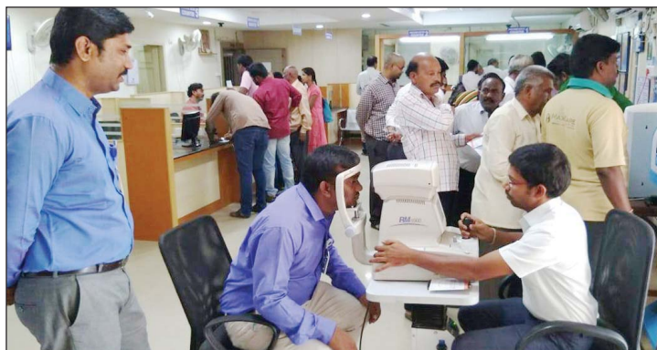
Health Camp for University Staff organised by State Bank of India, KU Branch