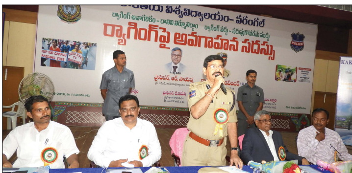
Workshop on Ragging