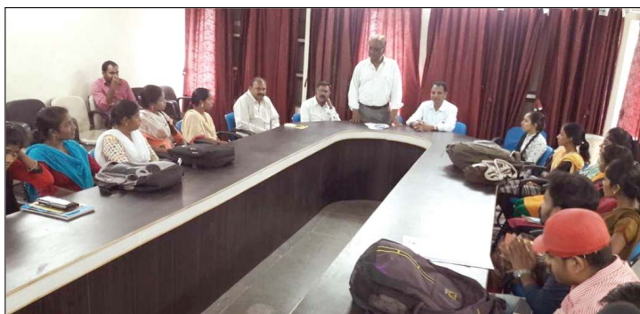
World Tourism Day