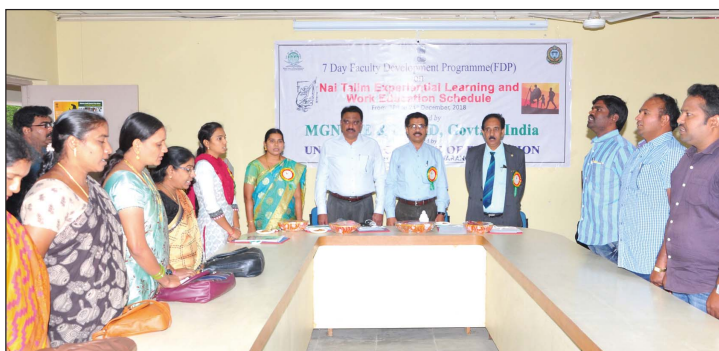
Faculty Development Programme

Women faculty and non-teaching staff celebrating the rich traditional nine day Bhatkamma Festival in the campus singing songs in the praise of Goddess to bless their families with good health and prosperity.