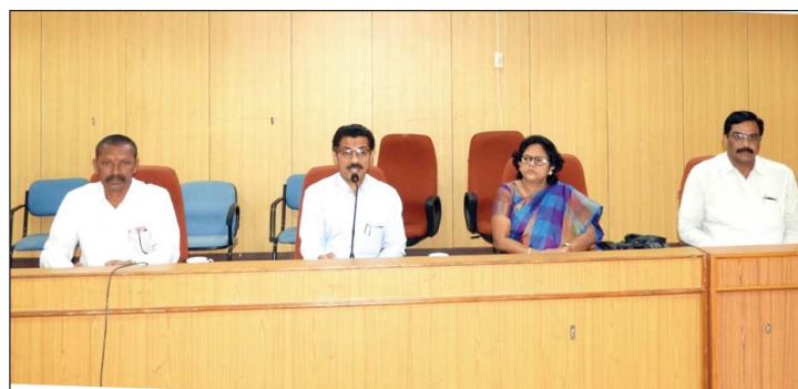
Meeting with State Audit Officials