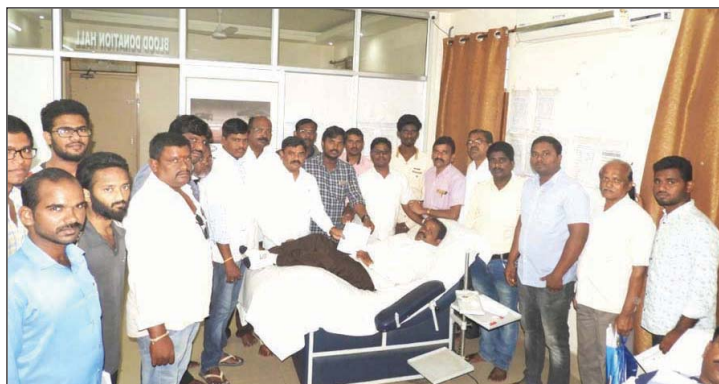
Blood Donation Camp on the occasion of University Formation Day on 19th August