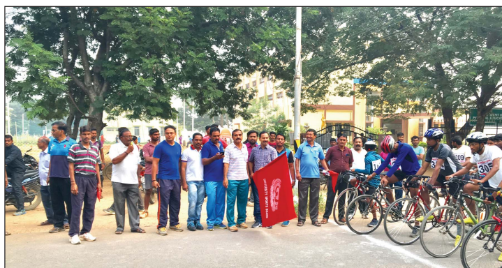
Cycle Racing Competitions for the students