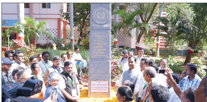
Unveiling of Pylon