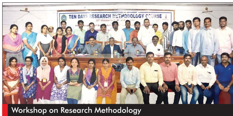
Workshop on Research Methodology