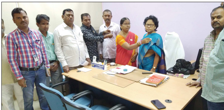
Rashtriya Ekta Diwas

Rashtriya Ekta Diwas (National Unity Day) event was organised 31st October to pay tributes to Sardar Vallabhbhai Patel, the Iron Man of India who was instrumental in keeping India united. It is an opportunity to re-affirm the inherent strength and resilience of our nation to withstand the actual and potential threats to the unity, integrity and security of our country.