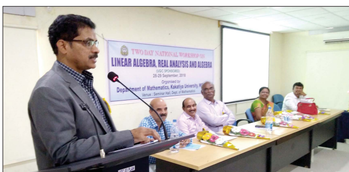
Workshop - Mathematics Dept.