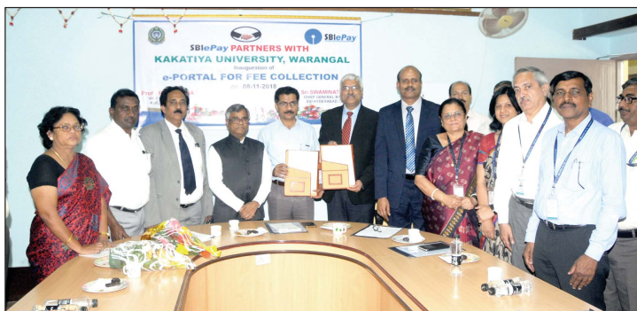
MoU with State Bank of India