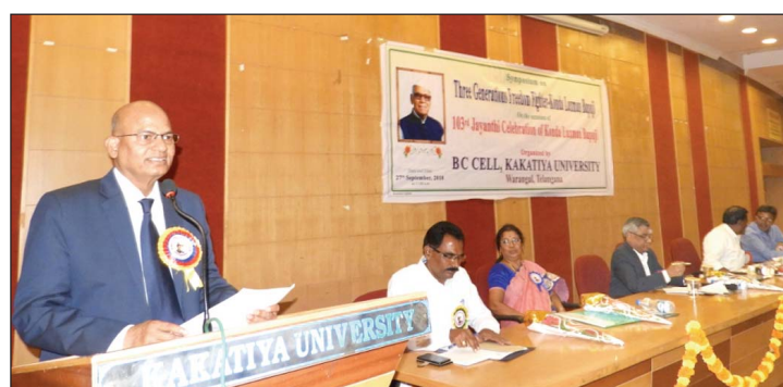
Konda Laxman Babuji Jayanthi