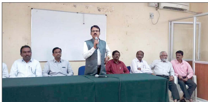
Swachh Bharath Internship