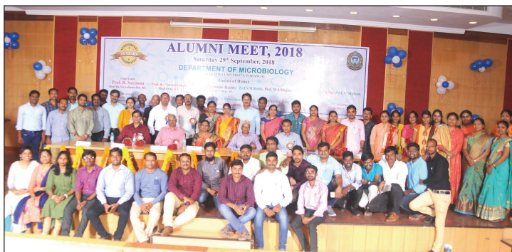
Alumni Meet - Microbiology Dept.