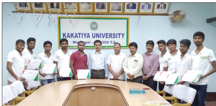
Swachh Bharath Internship