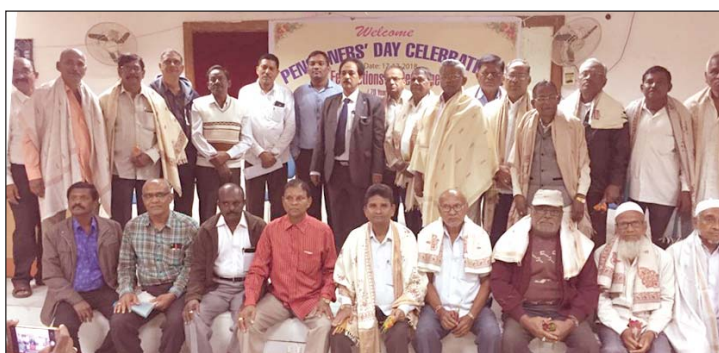
Felicitations on Pensioners Day