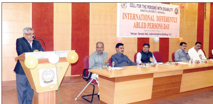
Differently Abled Persons Day