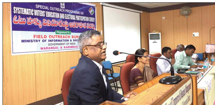
Programme on "Voters Education"