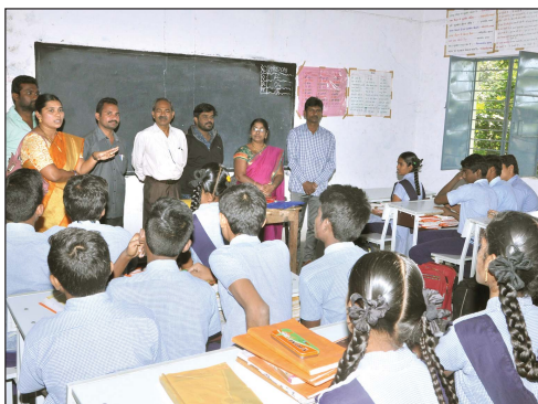
Faculty of Education interacting with School Children