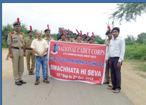
Swachhata Hi Seva