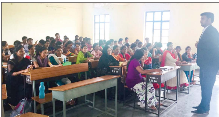
Students Induction Programme at University College of Engineering & Technology for Women