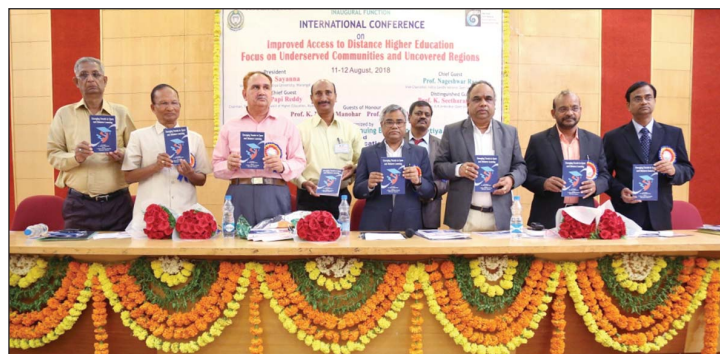
International Conference of ODL

Felicitating Dr. Ampasayya Naveen, Novelist and Sahitya Akademi Awardee by the Staff and Students of Department of Telugu on the Birth Anniversary of Sri Kaloji Narayana Rao