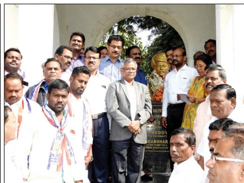
Mahatma Jyothi Rao Phule Vardhanthi