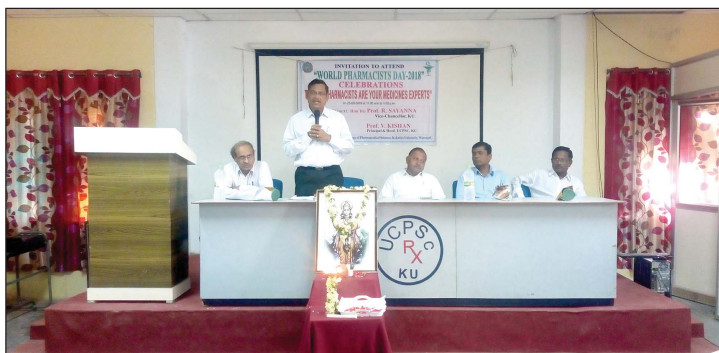
World Pharmacy Day