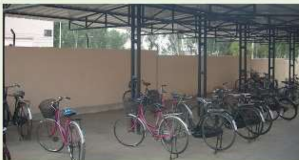
Shed Parking for Bicycles

Majority of the Population on the Campus is Students (65%). Because 78% of the Students reside in University Hostels, Vehicular Moment is minimised. Because majority of the University hail from backward regions they use bicycles for commuting.