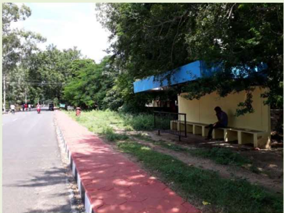
Bus Stop in the University Campus

All the administrative offices and departments of the university are constructed alongside the road within the campus spanning 1.25 kms. There are four bus stops