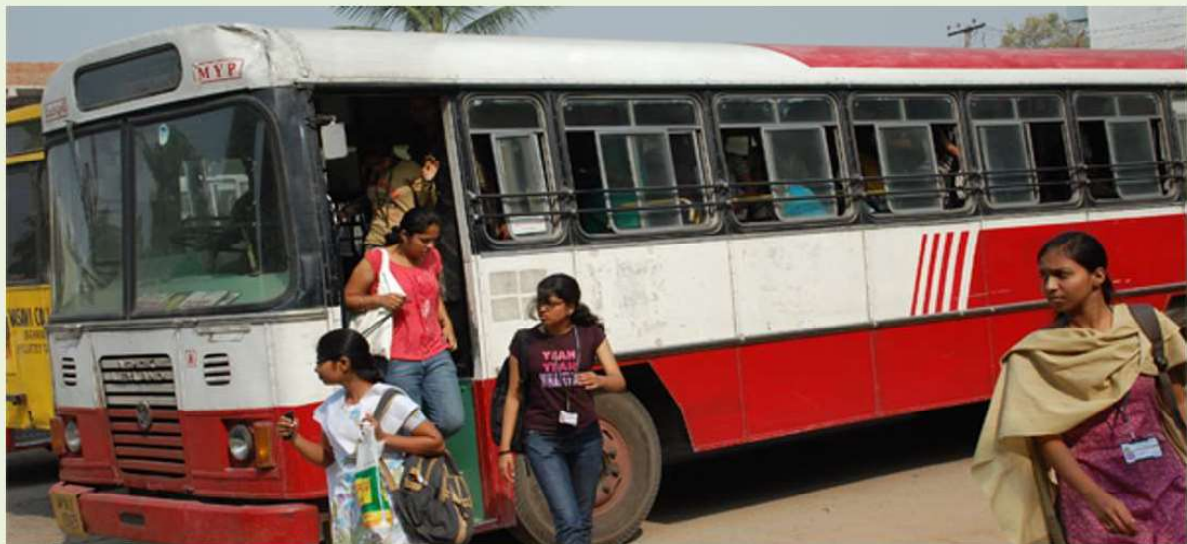
University Students Using the Public Transport

Shuttle Service is Provided by the Telangana State Road Corporation. Students get concession about 65% of the actual cost. Total cost is reimbursed by the University or the Local Government to economically backward students