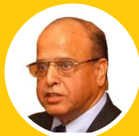
Padma Vibhushan Dr. K. Kasturirangan Chairman, National Education Policy -2020

National Education Policy (2020) - The Broad Contours