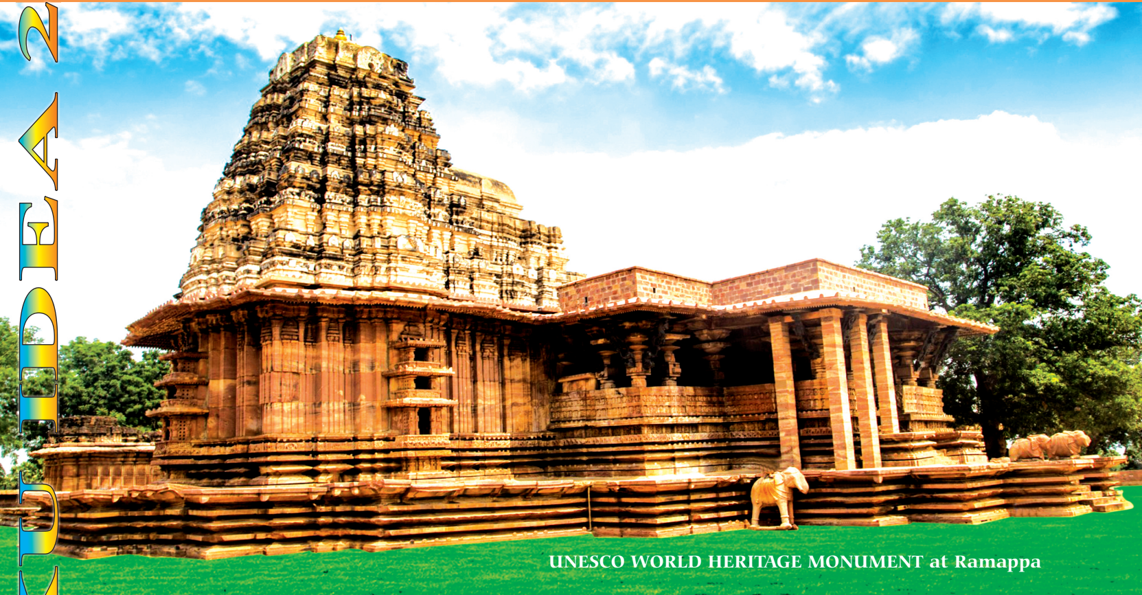
UNESCO WORLD HERITAGE MONUMENT at Ramappa

Organised by School of Distance Learning & Continuing Education Kakatiya University, Warangal